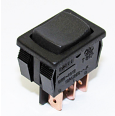
Item # GRS-4013A-0000, 4000 Series Center-Off Miniature Rocker Switches

Email: info@cwind.com • Website: http://www.cwind.com