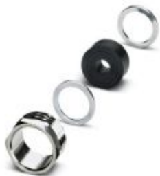
Cable gland, shielded: no, cable diameter range: 4 mm ... 14 mm

Please be informed that the data shown in this PDF Document is generated from our Online Catalog. Please find the complete data in the user's documentation. Our General Terms of Use for Downloads are valid ( http://phoenixcontact.com/download )