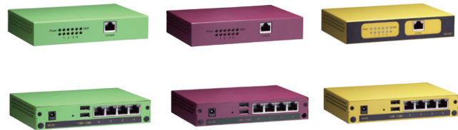
▲ Green color (optional)