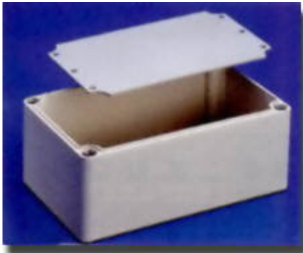
Inner Panel 2mm, Zinc Plated (with Corrosion Resistant Plating)