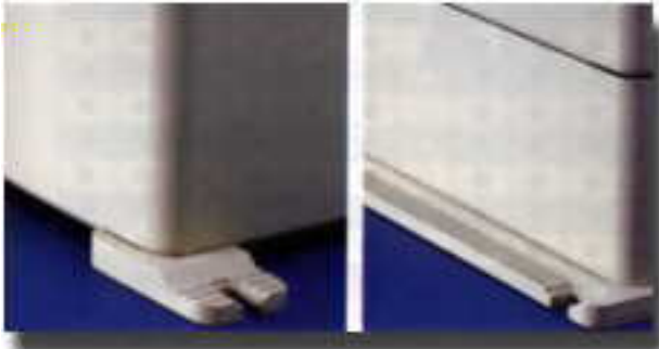
External Mounting Feet