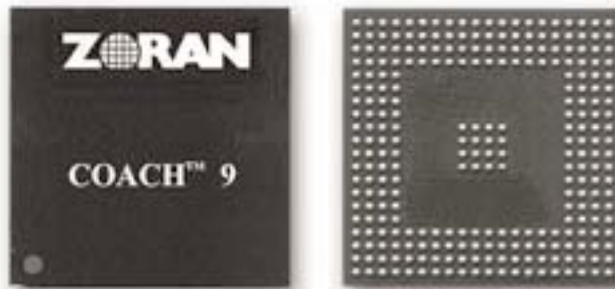
17cm x 17cm

For more information, contact Zoran's Sunnyvale office or the office nearest you: