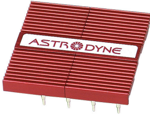
Unit measures 1.5"W x 2"L x 0.4"H