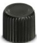
M12 sealing cap for unoccupied M12 plugs of the sensor/actuator cable, flush-type plugs and I/O devices in the field