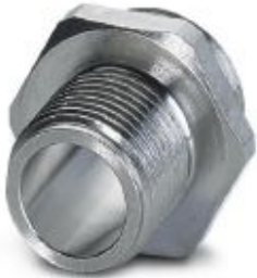
Housing screw connection with M12 standard thread, with O-ring, for 2-piece K, L, and M-coded THR contact carriers

Please be informed that the data shown in this PDF Document is generated from our Online Catalog. Please find the complete data in the user's documentation. Our General Terms of Use for Downloads are valid ( http://phoenixcontact.com/download )