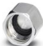
M12 metal sealing cap for unoccupied M12 plugs of the sensor/actuator cable, flush-type plugs and I/O devices in the field