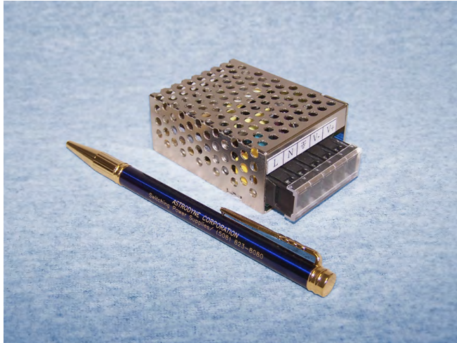
2.59"W x 2.0"L x 1.1"H