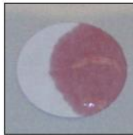
t = 5 sec.