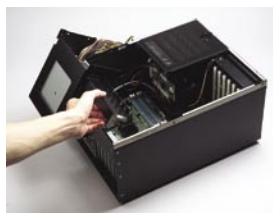
Power supply bracket with hinges