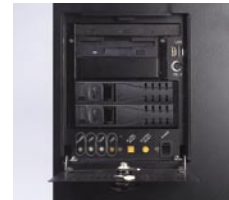
One slim CD-ROM drive, two 3.5" disk drives & two removable SATA HDD trays