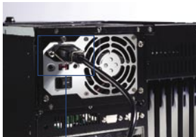
Plug ring-lock securely fastens the power cord (PS-400ATX-ZB)