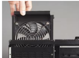
Easy-to-maintain cooling fan & filter