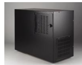
Bidirectional wall-mountable design