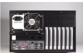
Bottom view of IPC-7143