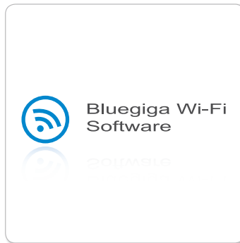
Enhanced Bluegiga software