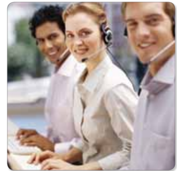
Professional, agile technical support