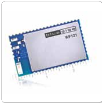
Reliable, state-of-the-art hardware

Choosing Bluegiga will save your resources, time and money.