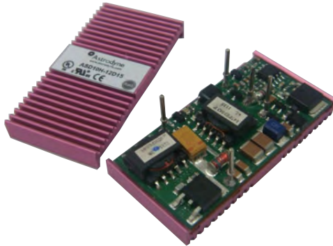
Unit measures 1"W x 2"L x 0.41"H