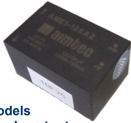
Models Single output