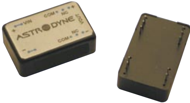
Unit measures 0.8"W x 1.25"L x 0.4"H