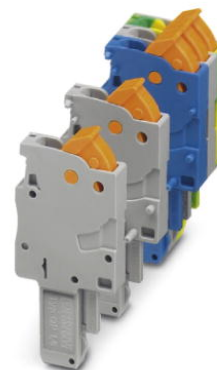
Illustration shows various versions of the product (left, center and right element) in different color combinations

http://eshop.phoenixcontact.de/phoenix/treeViewClick.do?UID=3051014