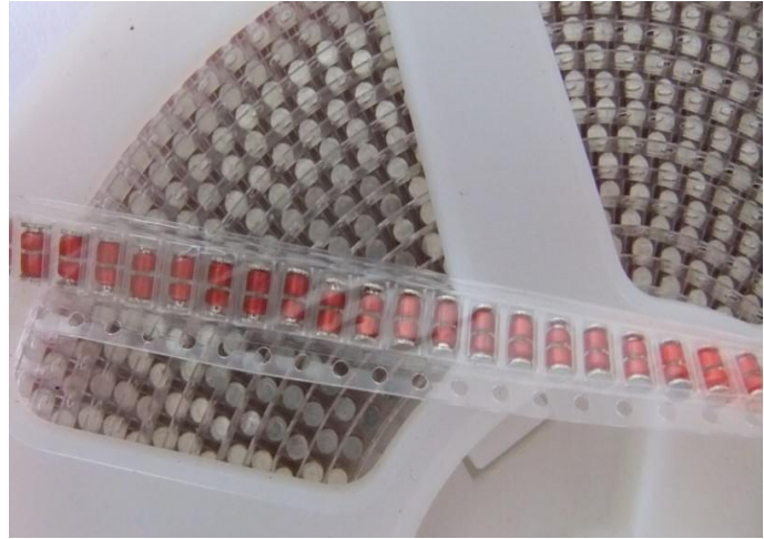
SMB Series Photo