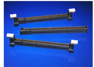
iCool Vertical versions