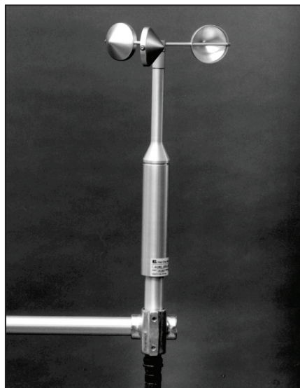
010C Wind Speed Sensor