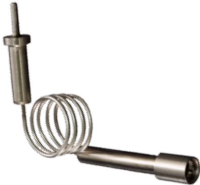
831-002 #12 Assembly for MIL-DTL-38999 Series II, Series 79 and Series 80 Mighty Mouse