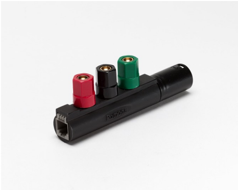
Model 7288 XLR (M) / Triple Binding Post / RJ11