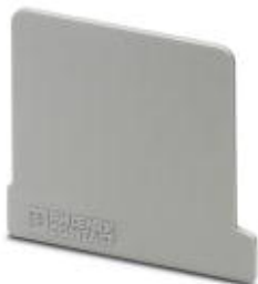
End cover, Length: 42.5 mm, Width: 1.3 mm, Color: gray

Please be informed that the data shown in this PDF Document is generated from our Online Catalog. Please find the complete data in the user's documentation. Our General Terms of Use for Downloads are valid ( http://download.phoenixcontact.com )